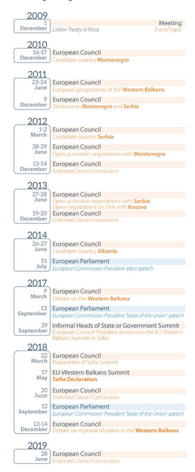
Figure 2 – European Council meetings considering enlargement to the Western Balkans